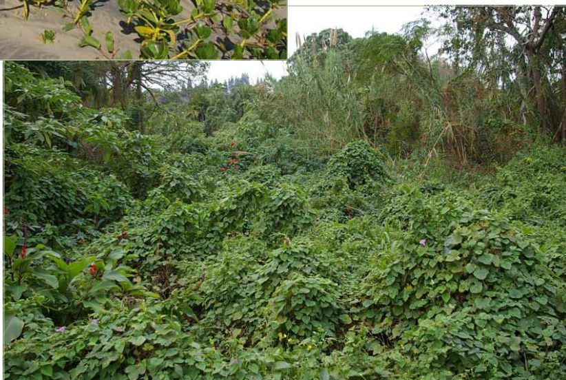
A degraded patch of coastal vegetation invaded by invasive alien ornamentals at Umkomaas on the KZN south coast

Contact the 'Green Scorpions' to report environmental transgressions. 24 hour Environmental Crimes and Incident Hotline on 0800 205 005