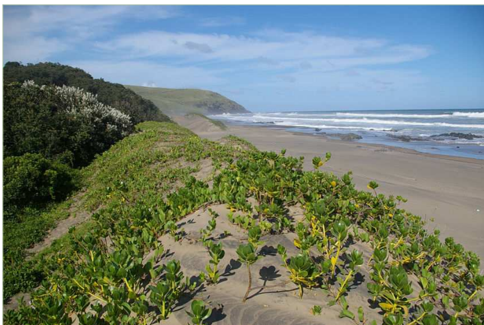
A precious piece of intact natural vegetation along the Eastern Cape coast.

www.countdown2010.net - official IYB 2010 web site of the International Union for the Conservation of Nature