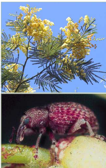
Black wattle ( Acacia mearnsii ) and the seed-feeding weevil ( Melanterius maculatus )

Biological weed control is the use of natural enemies to reduce the vigour or reproductive potential of an invasive alien plant. The principle is that plants often become invasive when they are introduced to a new region without any of their natural enemies. The alien plants therefore gain a competitive advantage over the indigenous vegetation, because all indigenous plants have their own natural enemies that feed on them or cause them to develop diseases. Biological control is an attempt to introduce the alien plant's natural enemies to its new habitat, with the assumption that these natural enemies will remove the plant's competitive advantage until its vigour is reduced to a level comparable to that of the natural vegetation. Natural enemies that are used for biological control are called biocontrol agents.