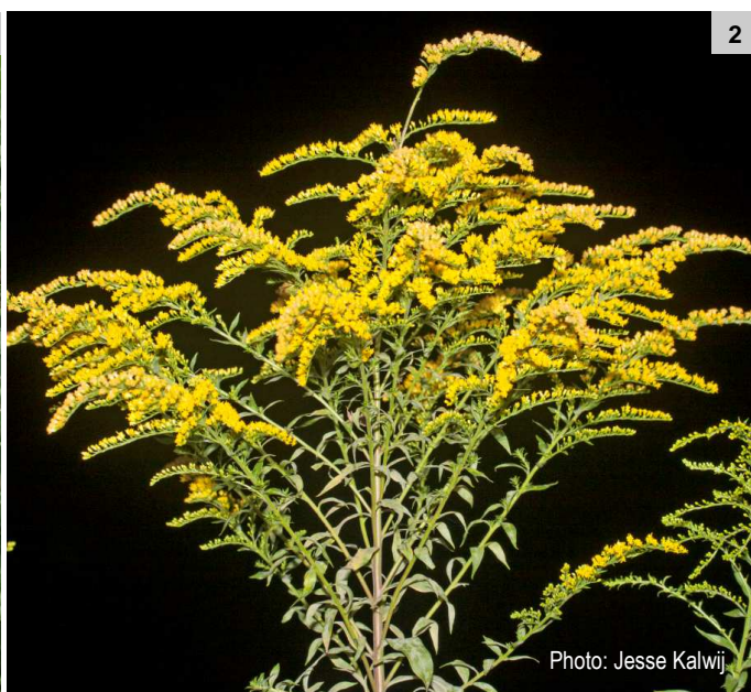
The typical pyramidal shape of a Solidago altissima inflorescence

The two goldenrods are closely related taxa (subsection Triplinervae ). Both belong to the S. canadensis complex, are highly variable in their appearance and have an unclear taxonomic status. The vernacular names of S. gigantea (giant goldenrod, late goldenrod, early goldenrod, smooth goldenrod, tall goldenrod) and S. altissima (late goldenrod, tall goldenrod) overlap too much to be reliably used, which is why we prefer to use the scientific names here. Both can grow as high as 200 cm with a conspicuous broad pyramidal panicle consisting of a central axis and recurving branches. The two species can be distinguished as follows (Semple & Cook 2006):