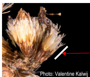
Pappus*: a tuft of bristles that crowns the fruit and aids in dispersal of the fruit.

Solidago gigantea typically has a glabrous stem and a glaucous appearance ( photo 3b ). Pappus length 2.0–2.5 mm. Underside of leaves often glabrous. This species tolerates moist habitats much better than the other.