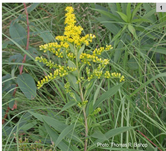
Solidago gigantea in flower. Sani Pass, KwaZulu-Natal

Most goldenrods ( Solidago spp; Asteraceae) originate from North America where they occur in prairies and in the understory of young forests. Due to their attractive, bright-yellow flowers S. gigantea Aiton ( photo 1 ) and S. altissima L. ( photo 2 ) were introduced to Europe in the mid-1700s. Nowadays these goldenrods are considered to be amongst the most aggressive transformative species of European grasslands. In February 2014 the first naturalised population of S. gigantea was discovered in Sani Pass, KwaZulu-Natal (Kalwij et al. 2014). In addition, a large naturalised population of S. altissima was discovered in a pine plantation near Ngeli Mountain in the Weza Forest Reserve ( photo on page 1 ) and a small one in Hilton, both KwaZulu-Natal.